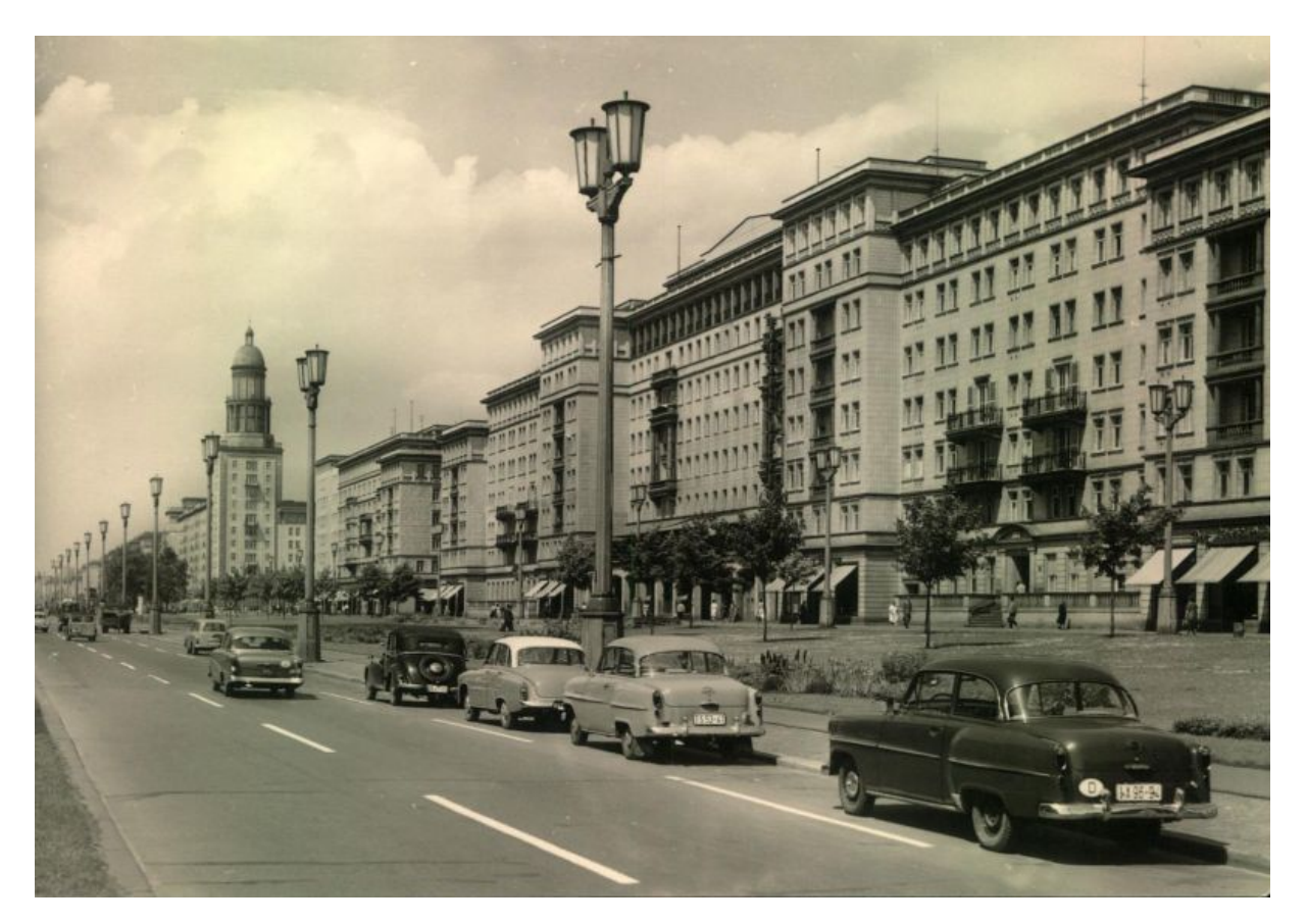
Friedrischain 1962.