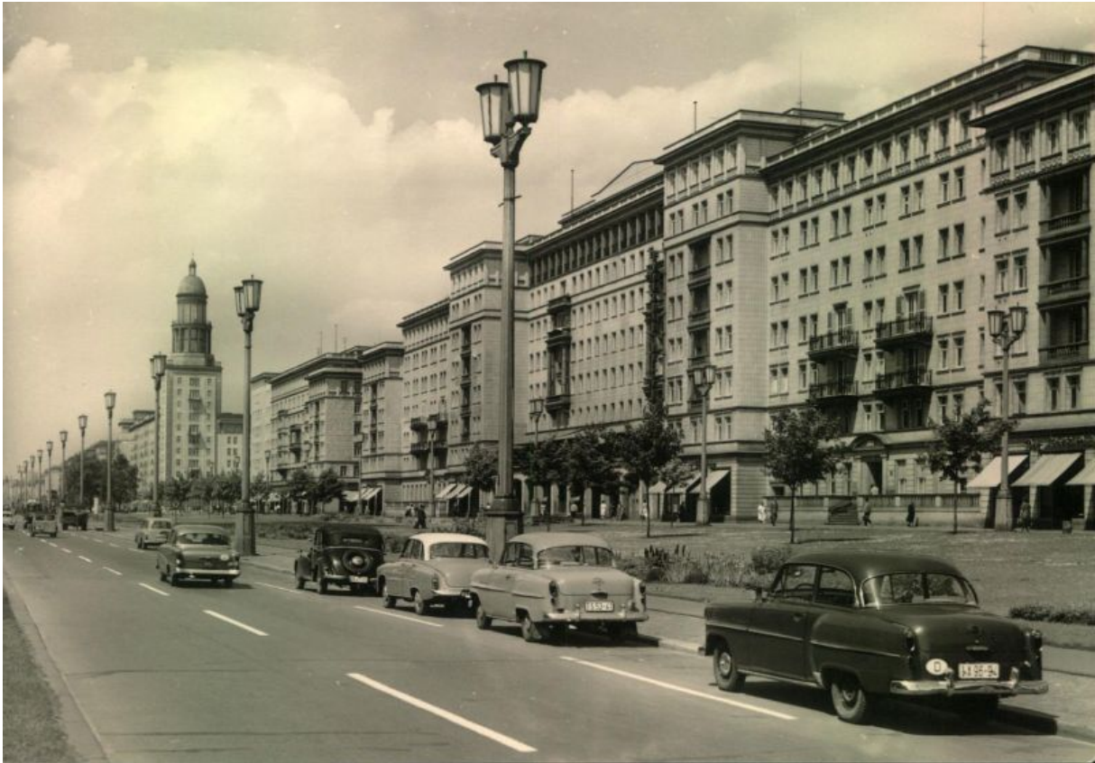
Friedrischain 1962.